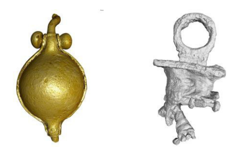
The bracelet (left) and the sanitary tool (right) from the necropolis "A la montagne" (images: Paul Scherrer Institut)

This presentation describes the investigation of two objects from a necropolis (Nécropole à la Montagne) in Avenches (VD, Switzerland): a bracelet and a sanitary tool made of copper alloy and presenting different questions. In both cases it was necessary to get sight of the interior of the objects. For that purpose, completely non-destructively methods were needed. Although methods with X-rays are very common and easily available, they often fail when larger amounts of metals are involved. In such cases, neutron imaging methods can be very useful since the penetration of neutrons through metals is much higher and clear information about the inner content and structure of inspected objects can be obtained. In the same way, the state of preservation of the metal can be studied very carefully due to the high sensitivity of neutrons for hydrogen, a component in the corrosion products. Therefore, both objects were analysed by neutron imaging and X-rays with the facility NEUTRA at the Swiss spallation neutron source of the Paul Scherrer Institut. Energy-dispersive X-ray spectroscopy (SEM-EDS) was done at the University of Fribourg, Department of Geosciences. In addition, a non-metallic part of one object was studied by Raman-spectroscopy at the School of Engineering and Architecture of Fribourg. Based on these analyses it becomes possible to describe these two objects in a broad manner and to understand its manufacturing method.